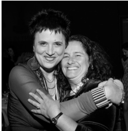
Special guest Eve Ensler