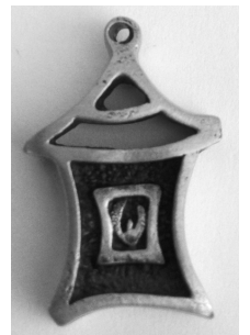
Charm necklace available in silver or pewter

Pewter Mezzuzah ♦ $85 each Kosher Mezzuzah Scroll ♦ $30 each Non-Kosher Mezzuzah Scroll ♦ $2 each