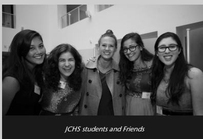
JCHS students and friends